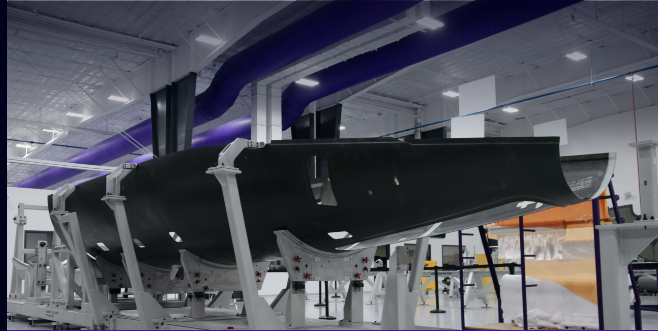
LOWER FUSELAGE SKIN