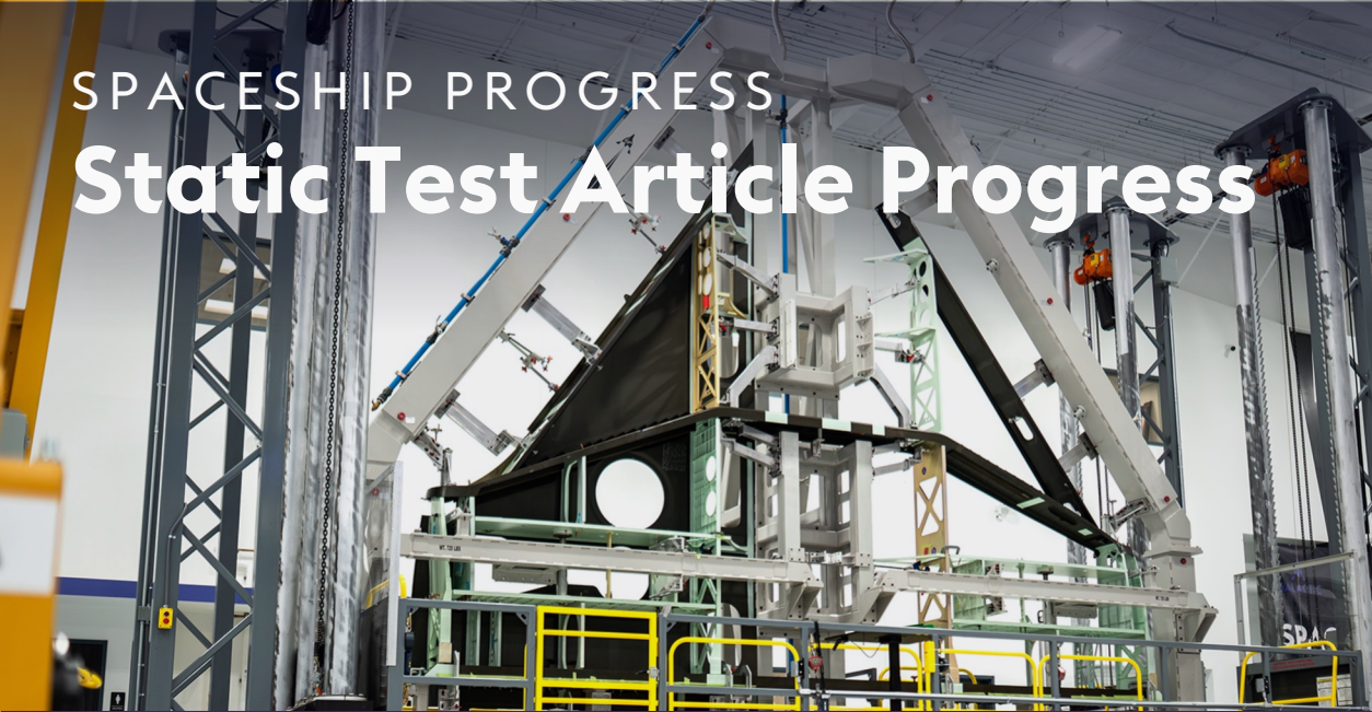
WING SKIN AND STRUCTURE