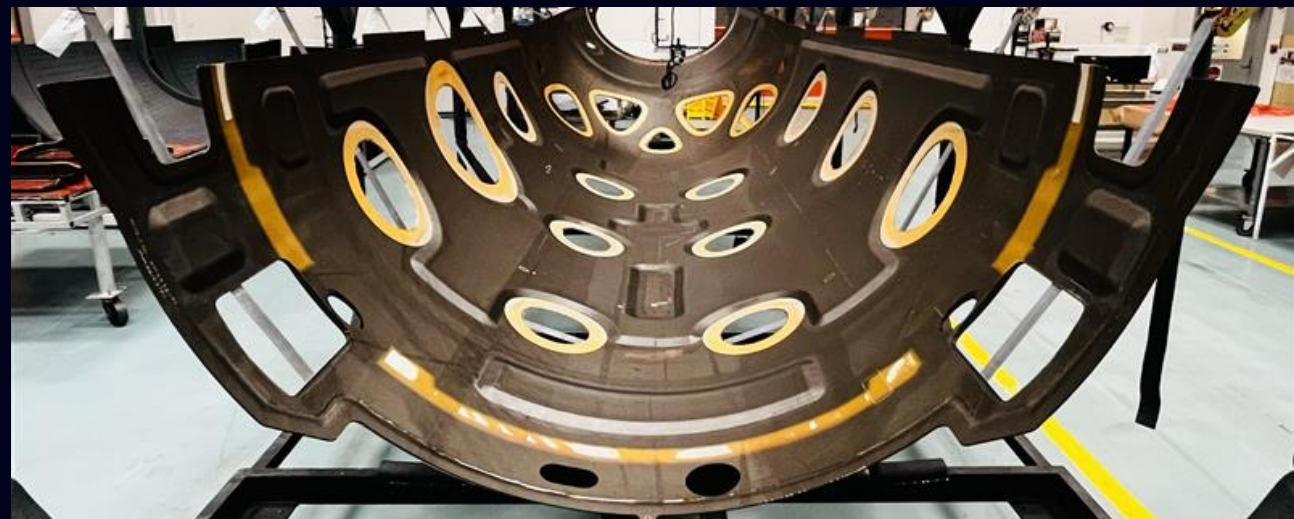
UPPER FUSELAGE SKIN