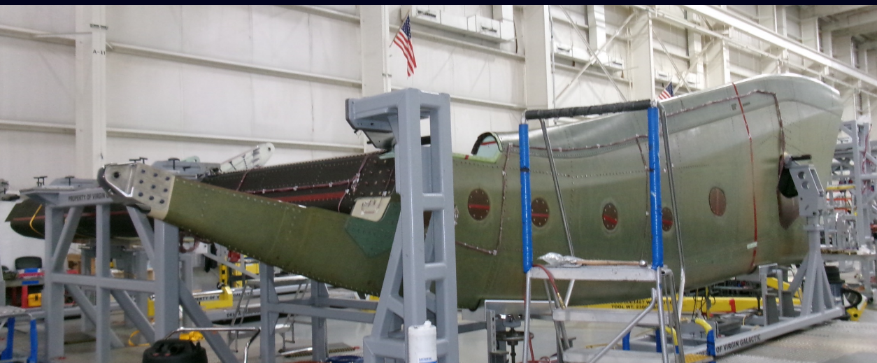
FEATHER STATIC TEST ARTICLE