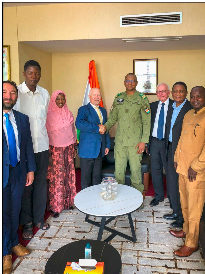
Figure 1: Management visits Niger's Mines Minister, Commissaire Colonel Ousmane Abarchi

Below are photos of Management’s recent site visit which are available on the Company’s website www.globalatomiccorp.com .