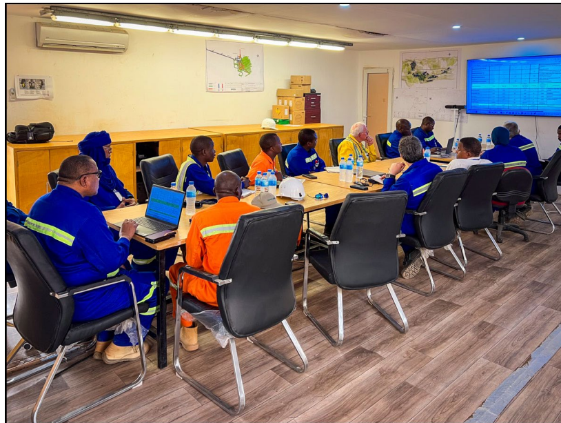
Figure 3: Department Heads morning meeting